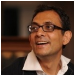
Prof Abhijit Vinayak Banerjee

United Nations High Commissioner for Human Rights