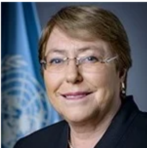
Dr Michelle Bachelet

University Center for Human Values, Princeton University, USA