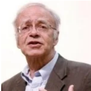
Prof Peter Singer