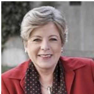
Prof Alicia Bárcena

Amref Health Africa & former Co-Chair of UHC2030 Steering Committee